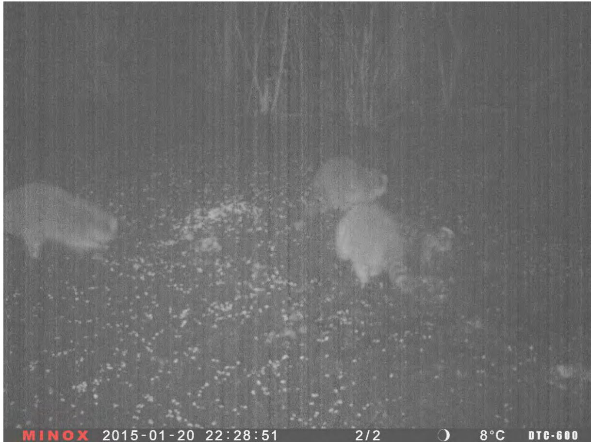
Photo 1: Three raccoons are feeding at the baiting site in a hunting area near to Budapest, Hungary (photo taken by camera trapping).

Csányi S., Márton M., Bóti Sz., Schally G. (2022) Vadgazdálkodási Adattár - 2021/2022. Vadászati év. Országos Vadgazdálkodási Adattár, Gödöllő, 70 pp.